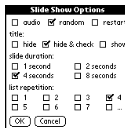
Figure 2-1. Slide Show Options

You can use the Peck application's slide show like flash cards to sharpen your visual recognition skills. To access the slide show options, shown in Figure 2-1, select the document list's 'Select/Slide Show Options' menu item, and check the 'random', 'hide & check', '4 seconds', and '4' repetitions.